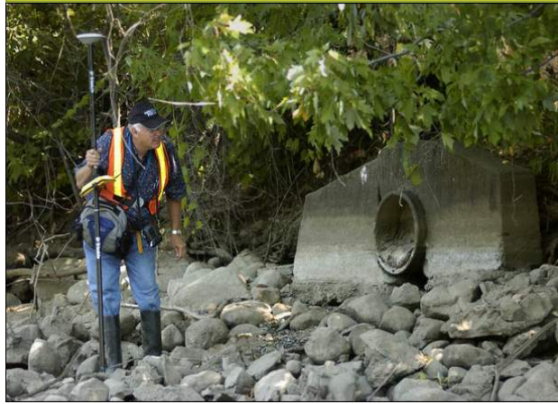
City of Lansing IDEP on the Grand River - Draw Down