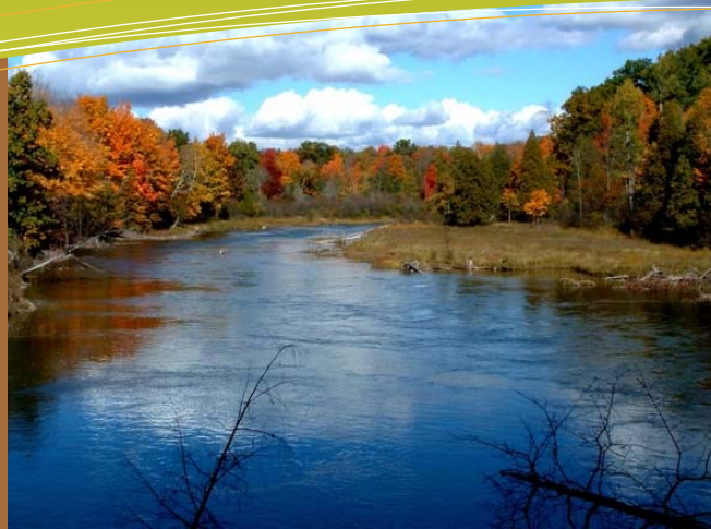
Grand River, Michigan